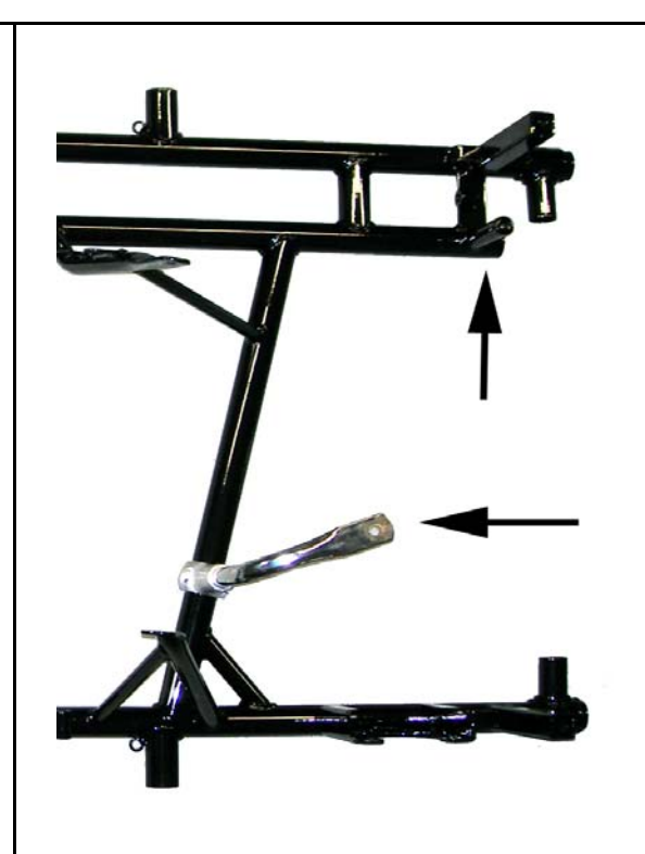
Photo from above of the frame with the section of the two supports for the exhaust system