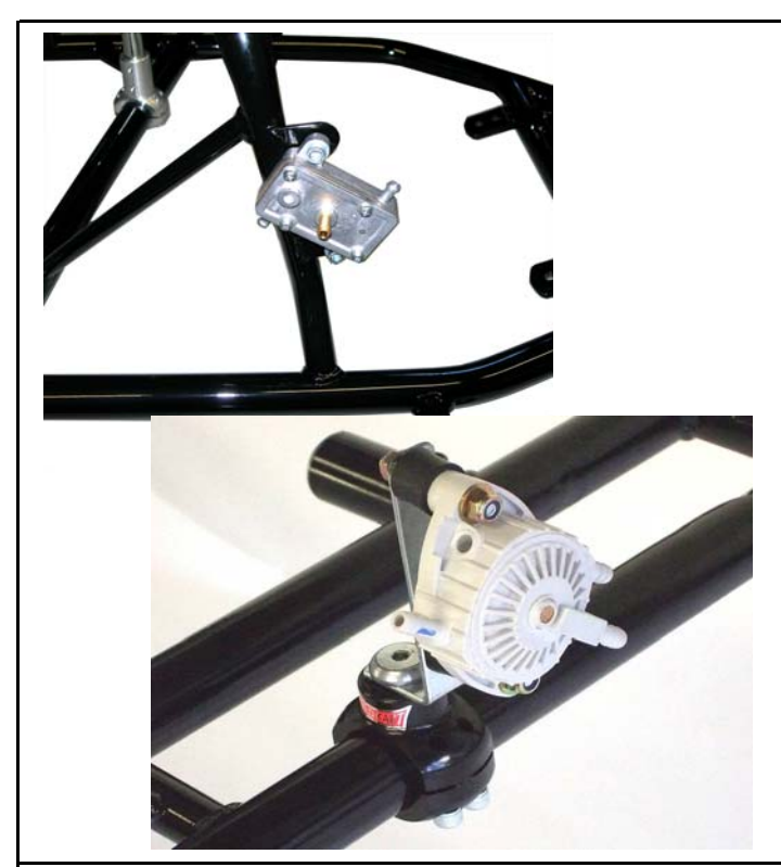
Photo of the frame with the section of the support for the fuel pump (fuel pump mounted) - 2 versions