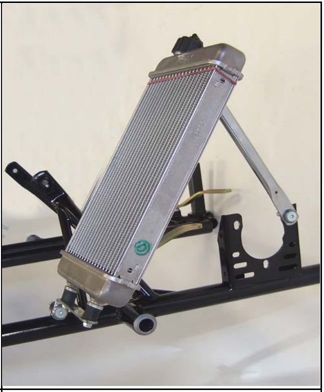
Photo of the frame from the side with the section of the supports for the radiator (radiator mounted)