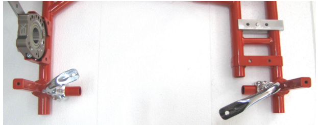
Foto from above of the frame with the section of the two supports for the exhaust system