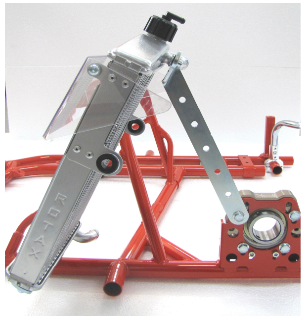
Foto of the frame from the side with the section of the supports for the radiator (radiator mounted)