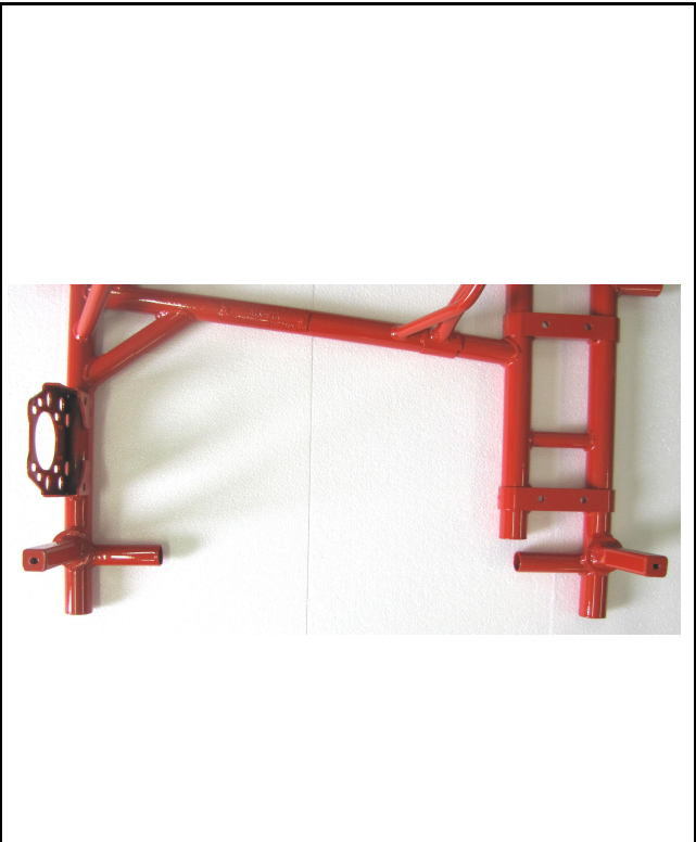
Foto from above of the frame with the section of the two supports for the RTPS (Rear Tire Protection System)