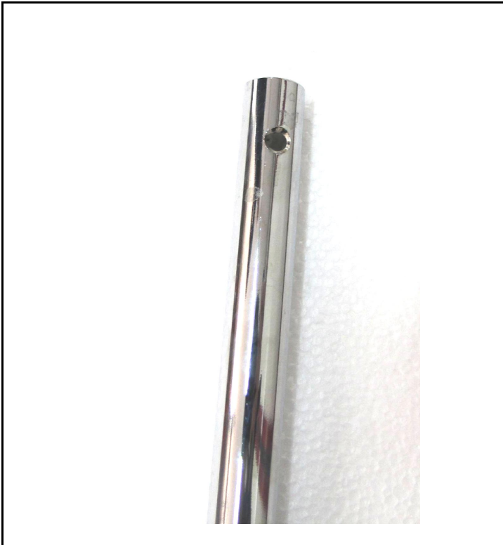
Foto from the steering column with the section with the knurling for the steering wheel hub (knurling according to DIN 82 - RAA1).