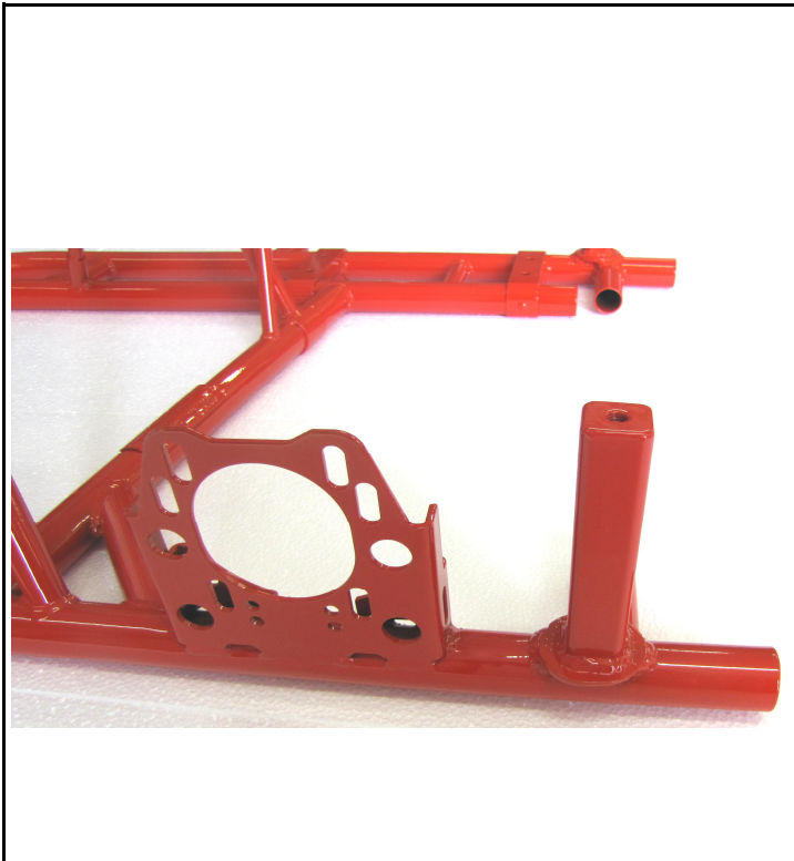
Foto of the frame from the side with the section of the support for the RTPS (Rear Tire Protection System)