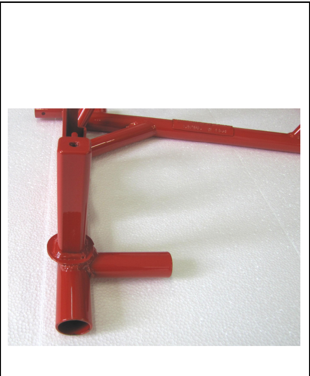
Foto of the frame from the back with the section of the support for the RTPS (Rear Tire Protection System)