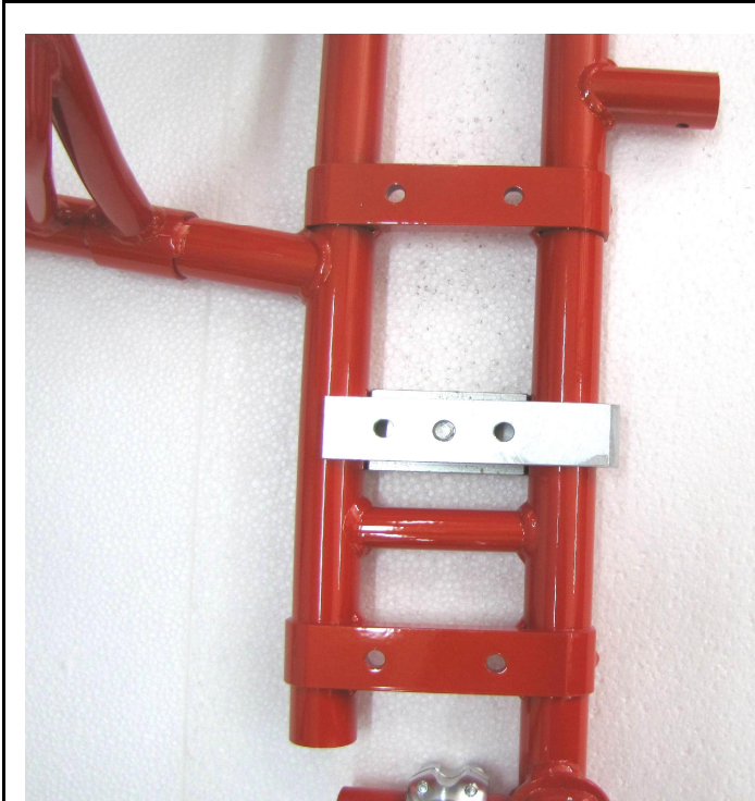
Foto from above of the frame with the section of the engine mount