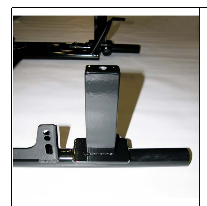
Photo of the frame from the side with the section of the support for the RTPS (Rear Tire Protection System)