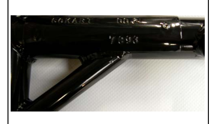
Photo from above of the frame Photo of the identification plate of the frame with the (without any monted part) name of the chassis model.