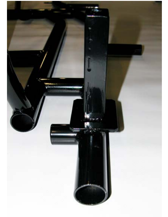
Photo of the frame from the back with the section of the support for the RTPS (Rear Tire Protection System)