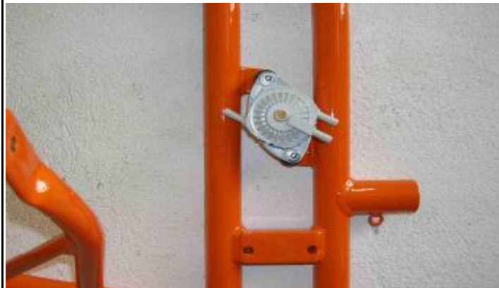
Foto of the frame with the section of the support for the fuel pump (fuel pump mounted)