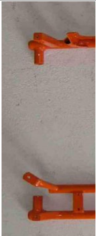
Foto from above of the frame with the section of the two supports for the RTPS (Rear Tire Protection System)