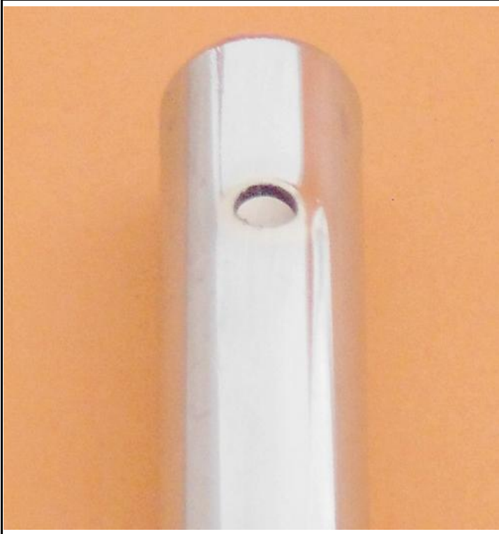
Foto from the steering column with the section with the knurling for the steering wheel hub (knurling according to DIN 82 - RAA1).