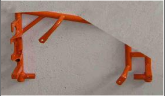
Foto from above of the frame with the section of the two supports for the exhaust system