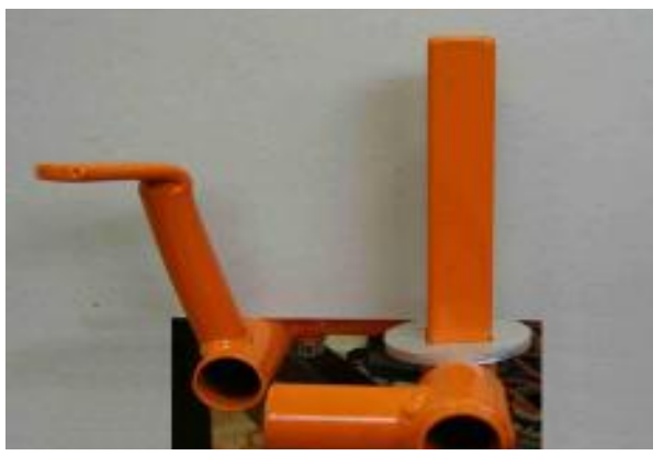
Foto of the frame from the back with the section of the support for the RTPS (Rear Tire Protection System)