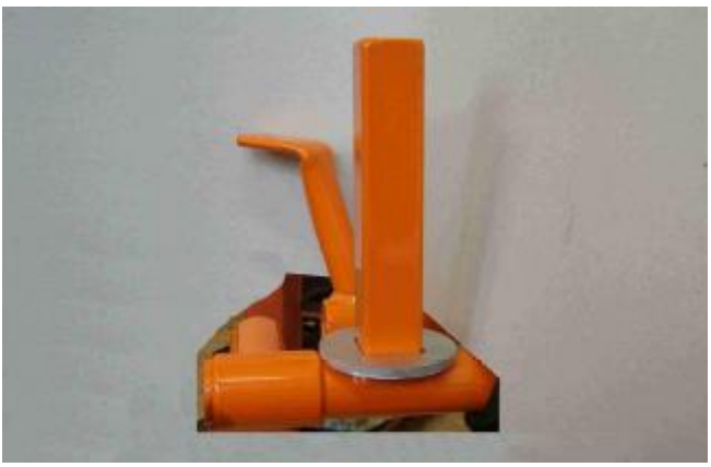
Foto of the frame from the side with the section of the support for the RTPS (Rear Tire Protection System)