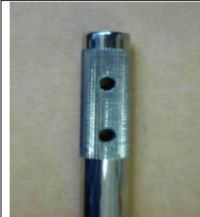
Foto from the steering column with the section with the knurling for the steering wheel hub (knurling according to DIN 82 - RAA1).