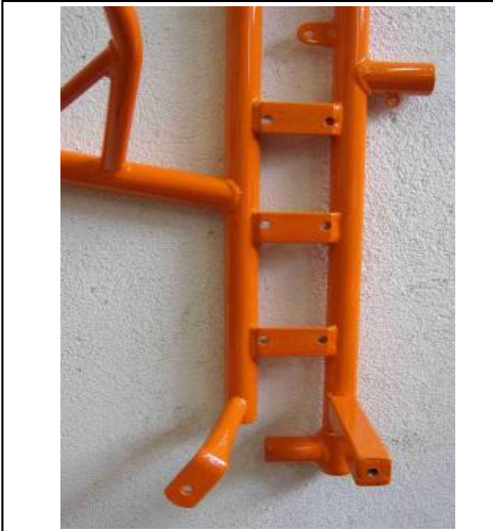
Foto from above of the frame with the section of the engine mount