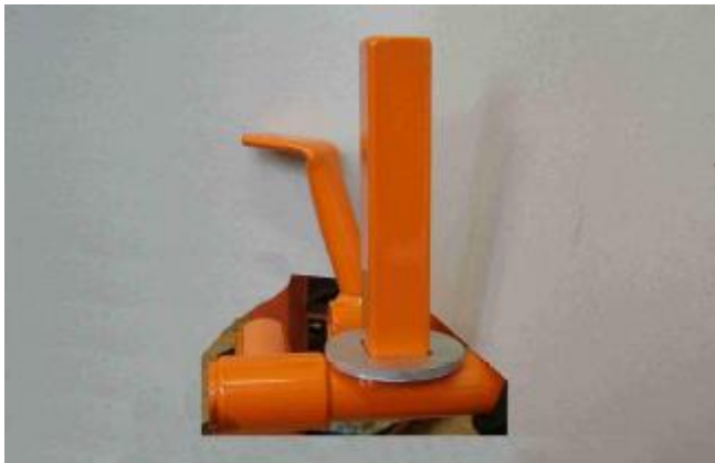
Foto of the frame from the side with the section of the support for the RTPS (Rear Tire Protection System)