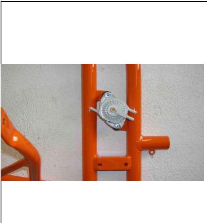
Foto of the frame with the section of the support for the fuel pump (fuel pump mounted)