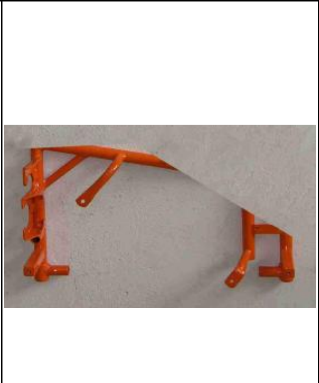
Foto from above of the frame with the section of the two supports for the exhaust system