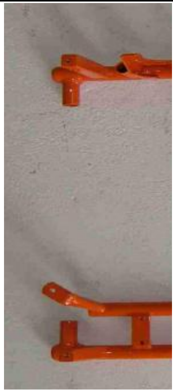
Foto from above of the frame with the section of the two supports for the RTPS (Rear Tire Protection System)