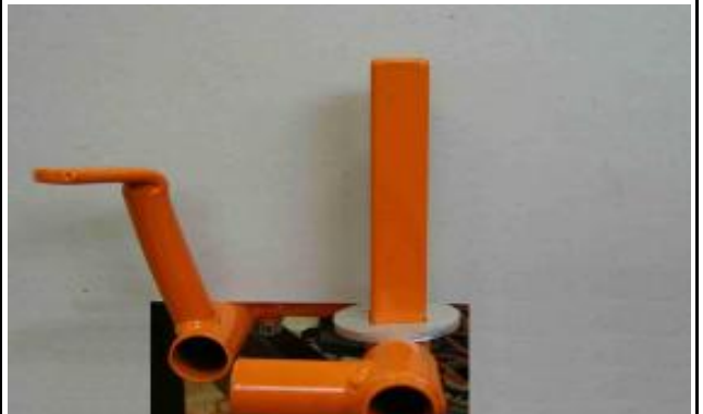
Foto of the frame from the back with the section of the support for the RTPS (Rear Tire Protection System)