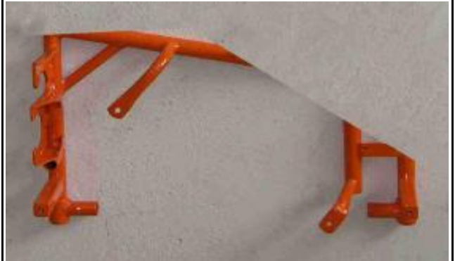
Foto from above of the frame with the section of the two supports for the exhaust system