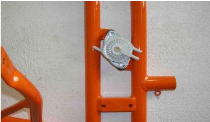
Foto of the frame with the section of the support for the fuel pump (fuel pump mounted)