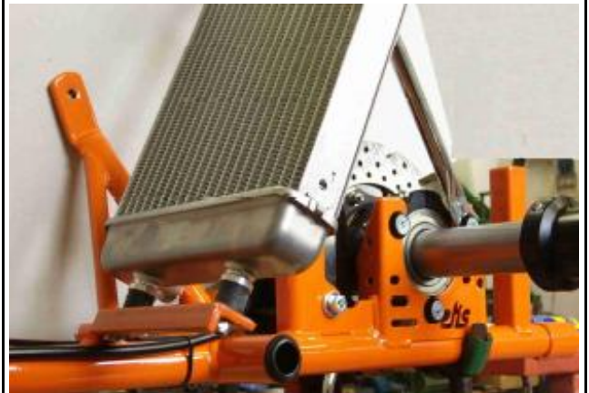
Foto of the frame from the side with the section of the supports for the radiator (radiator mounted)