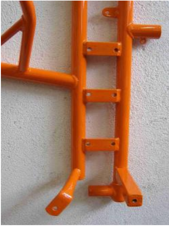
Foto from above of the frame with the section of the engine mount